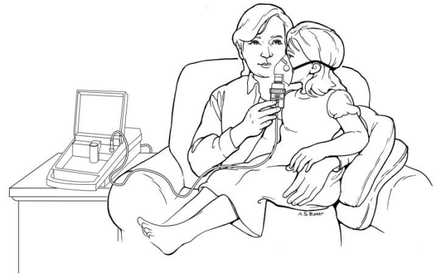
Picture 2 Getting an aerosol treatment.