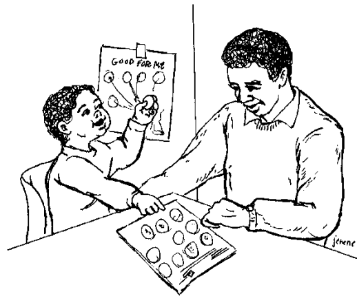
Picture 2 Reward your child's successes.