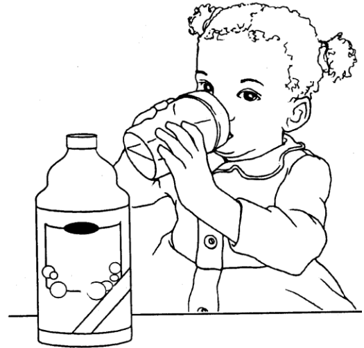
Picture 2 Give your child lots of liquids to drink.

If you need a doctor for your child, call the Nationwide Children's Hospital referral and Information Line at (614) 722-KIDS.