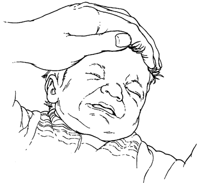
Picture 1 Gently rub the baby's head to help her fall asleep.