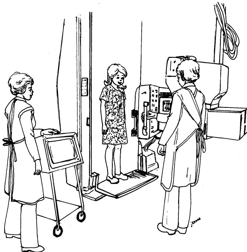
Picture 2 Having an upper GI series.